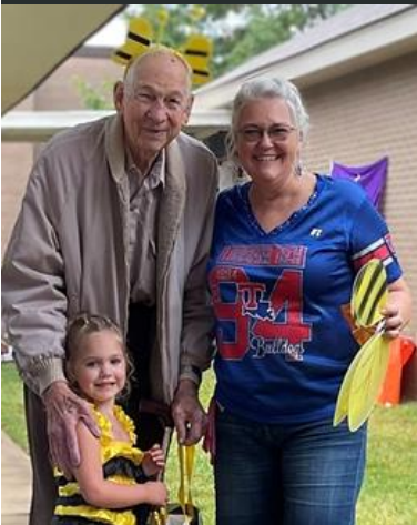
A good time was had by ALL ages! EBC FALL FAIR - 2022